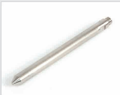
Long probe, Part No. 03-1326